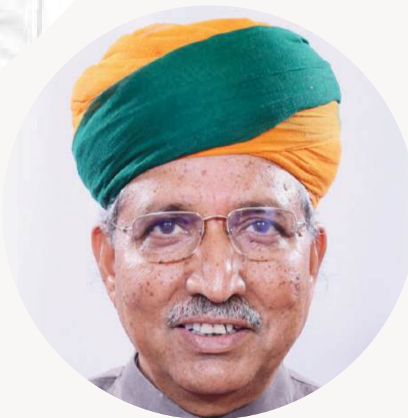
SHRI ARJUN RAM MEGHWAL

Hon'ble Union Minister (I/C) for Law & Justice as Guest of Honour