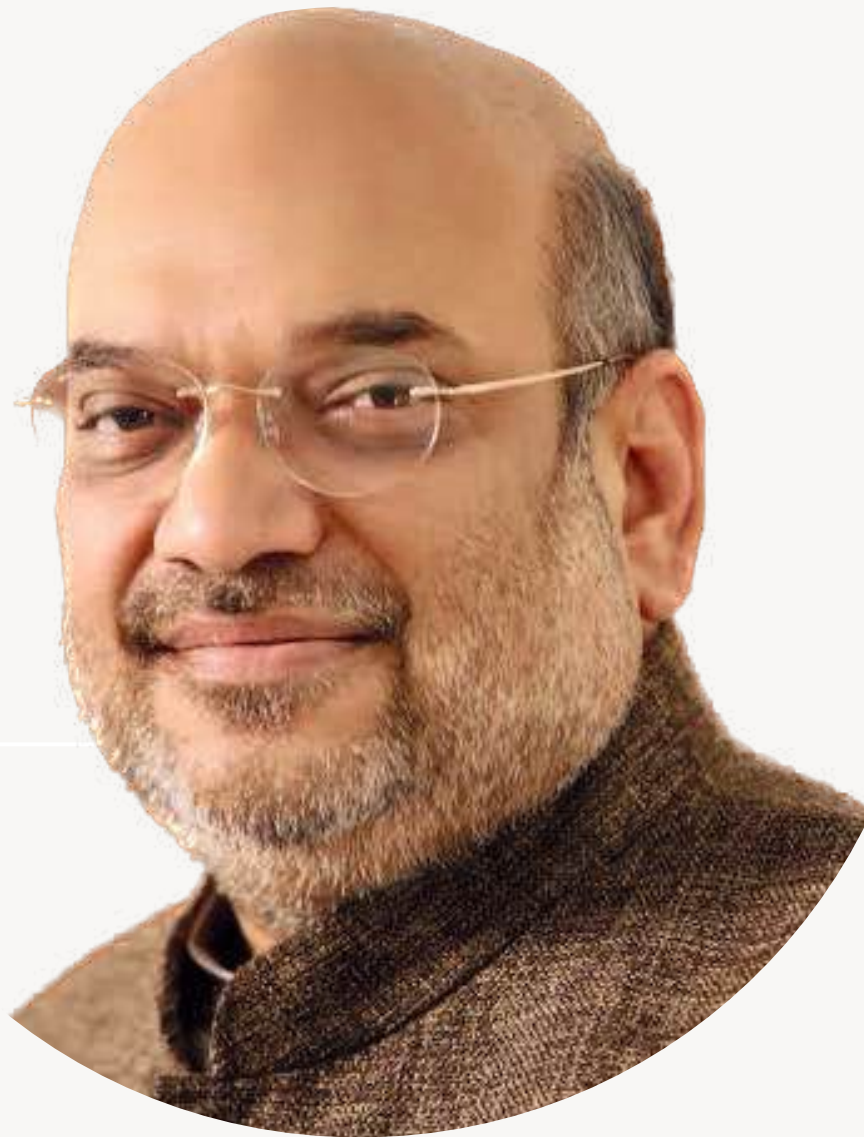
SHRI AMIT SHAH

Hon'ble Union Labour & Employment and Environment, Forest & Climate Change Minister Government of India