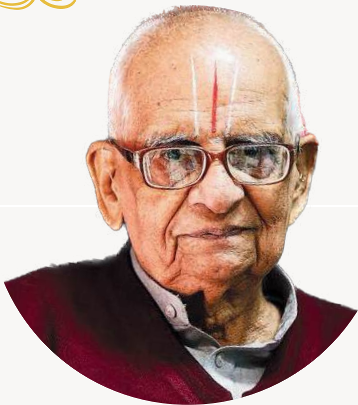
SHRI K. PARASARAN

Senior Advocate & Former Attorney General for India