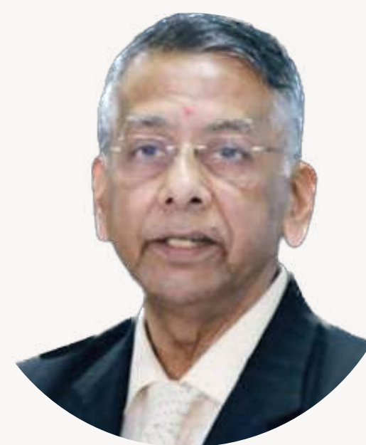
MR R. VENKATARAMANI Ld. Attorney General for India

Hon'ble Union Minister (I/C) for Law & Justice as Guest of Honour