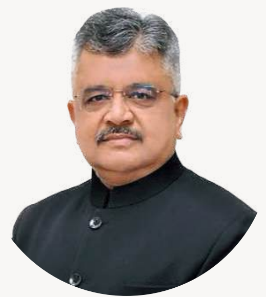
MR TUSHAR MEHTA Ld. Solicitor General of India