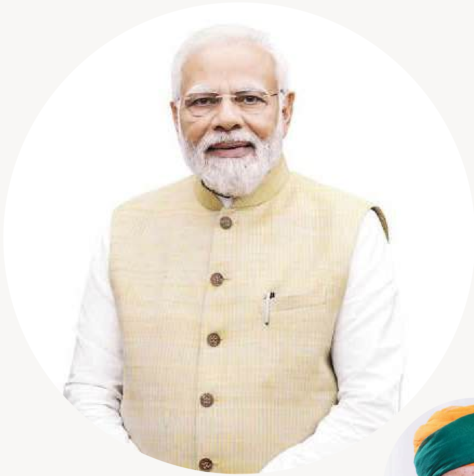
SHRI NARENDRA MODI