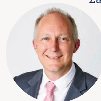
MR SAMUEL TOWNEND

Chair-elect Bar Council of England & Wales U.K.