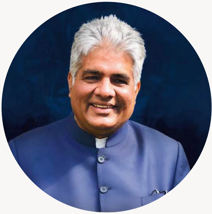
SHRI BHUPENDER YADAV

24.09.2023 | 02:00 TO 03:30 PM | VIGYAN BHAWAN, NEW DELHI