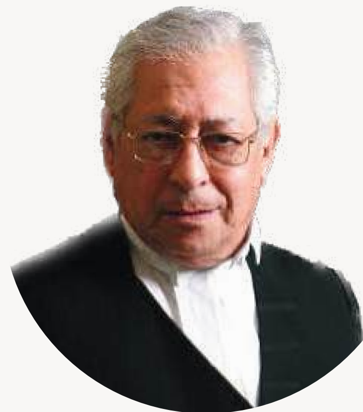
LATE SHRI SOLI J. SORABJEE

Senior Advocate & Fmr Chairman Bar Council of India