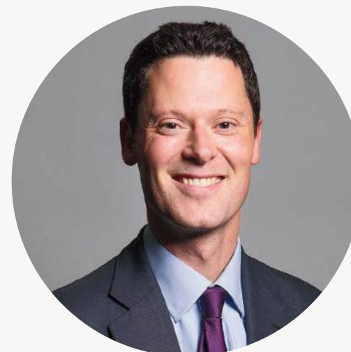
MR ALEX CHALK KC MP