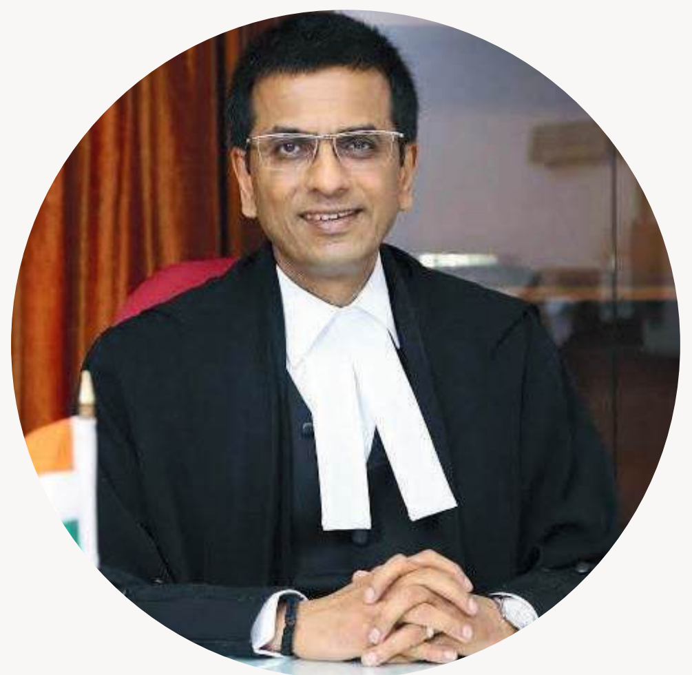
HON'BLE DR. JUSTICE D.Y. CHANDRACHUD