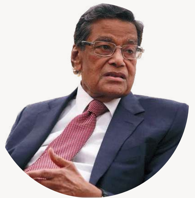
SHRI K.K. VENUGOPAL

Senior Advocate & Former Attorney General for India