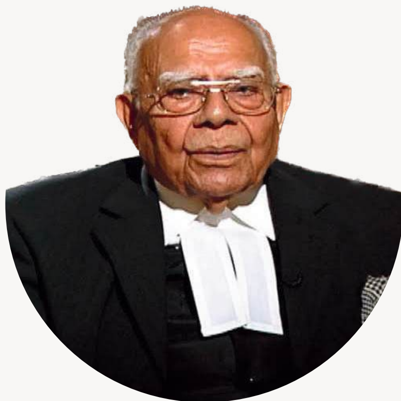
LATE SHRI RAM JETHMALANI

Senior Advocate & Fmr Chairman Bar Council of India