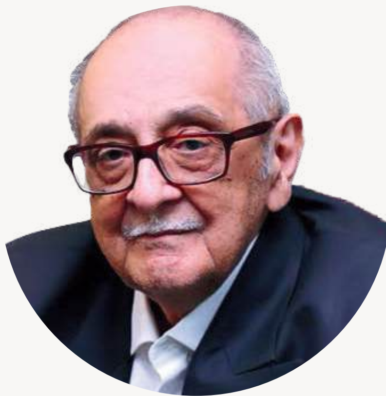
SHRI FALI S. NARIMAN

Senior Advocate & Former Attorney General for India