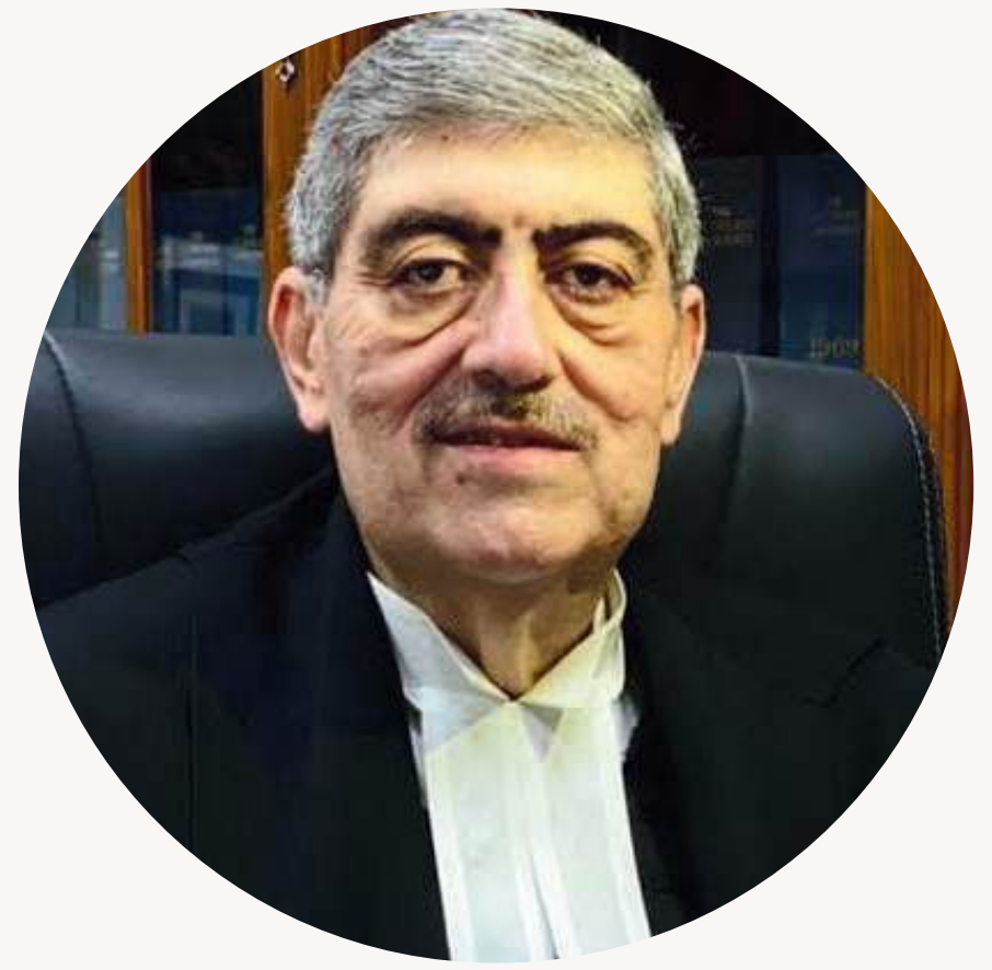
HMJ SANJAY KISHAN KAUL

Hon'ble Home Minister & Minister of Cooperation, Government of India